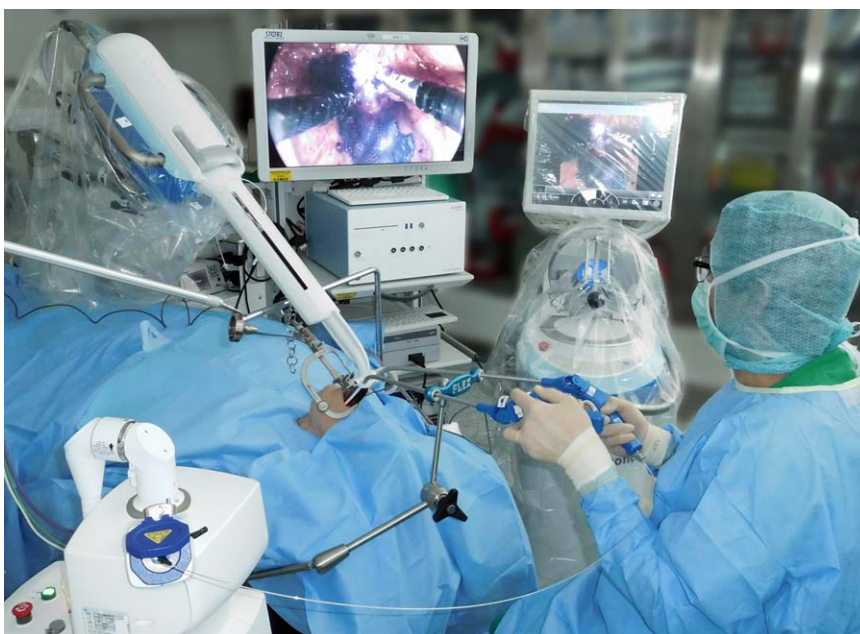
Fig. 2. Flexible instruments with laser fiber inserted in the guide tubes and visualized on the monitor.

A total of 80 patients were enrolled, of whom 79 subjects were treated according to the study protocol. Thirty-four patients were enrolled at the University Hospital of Essen (Germany), 18 at the University Hospital of Louvain (Belgium), 15 at the University Hospital of Marburg (Germany), and 13 at the University Hospital of Ulm (Germany). In one patient, the Flex Robotic System experienced a system failure during start-up, so the investigator did not attempt or perform any procedures on this subject. The remaining 79 patients were comprised of 44 males and 35 females with an average age of 64 years. In 72 patients the surgical procedure was successfully completed with the Flex Robotic System. Thirty-nine (54%) of these patients presented with